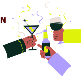
Exhibit Hall - 517D